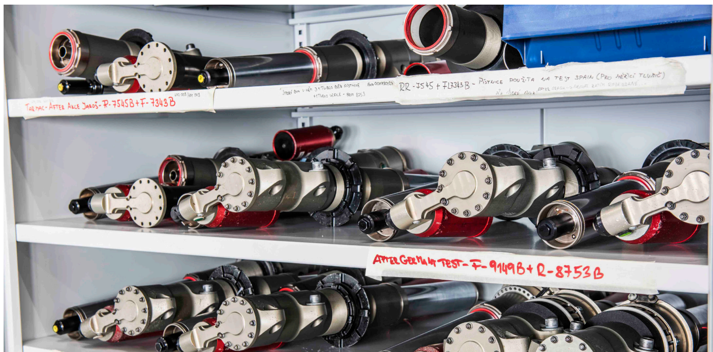
Well sorted: Dampers ready for all kind of roads

One of the biggest difference between the gravel and tarmac specification of the ŠKODA FABIA Rally2 evo lies in the dampers. They differ in stroke, length and settings. ŠKODA Motorsport also offers springs in more than ten different rates of stiffness. Furthermore, the chassis package includes three different types of stabilizers for front and rear axle. It is also possible to fine-tune the stiffness of the car thanks to three-way adjustable stabilizers. Regarding the brakes, two disc sizes and respective accessories are available. The customer can choose from different brake cylinder settings as well. Another big difference is definitely the size of the rims. For both gravel (15 inch) and tarmac (18 inch) specification the customer can select between affordable alloy and high-end magnesium versions.