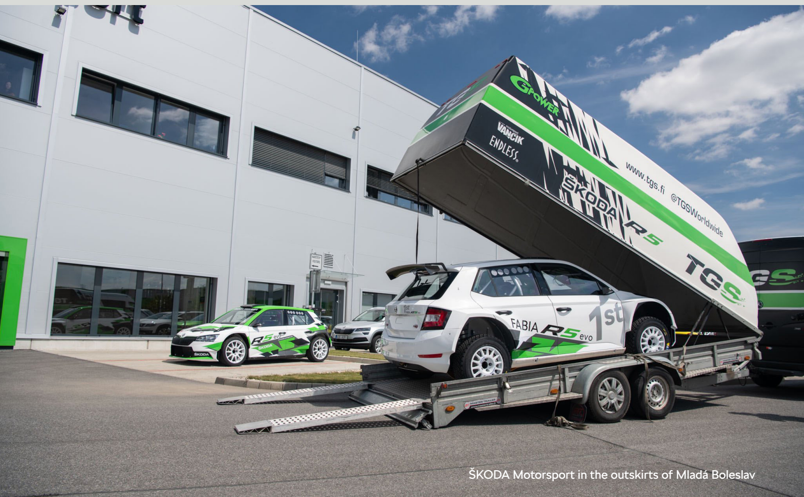
ŠKODA Motorsport in the outskirts of Mladá Boleslav

AT A GLANCE: ŠKODA MOTORSPORT IN MLADÁ BOLESLAV