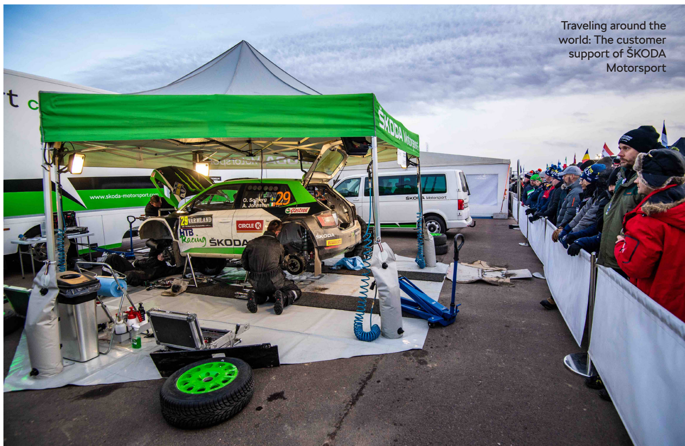
Traveling around the world: The customer support of ŠKODA Motorsport