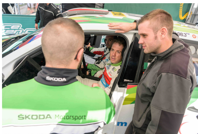
Listening to the customers: The engineers of ŠKODA Motorsport

after the technical status of the car in general during the rally. He recommends solutions to the team and gives advice concerning suspension, transmission or car protection and provides consultation for servicing the car during the rally. He assists during pre-event scrutineering and – if required – during final technical scrutineering