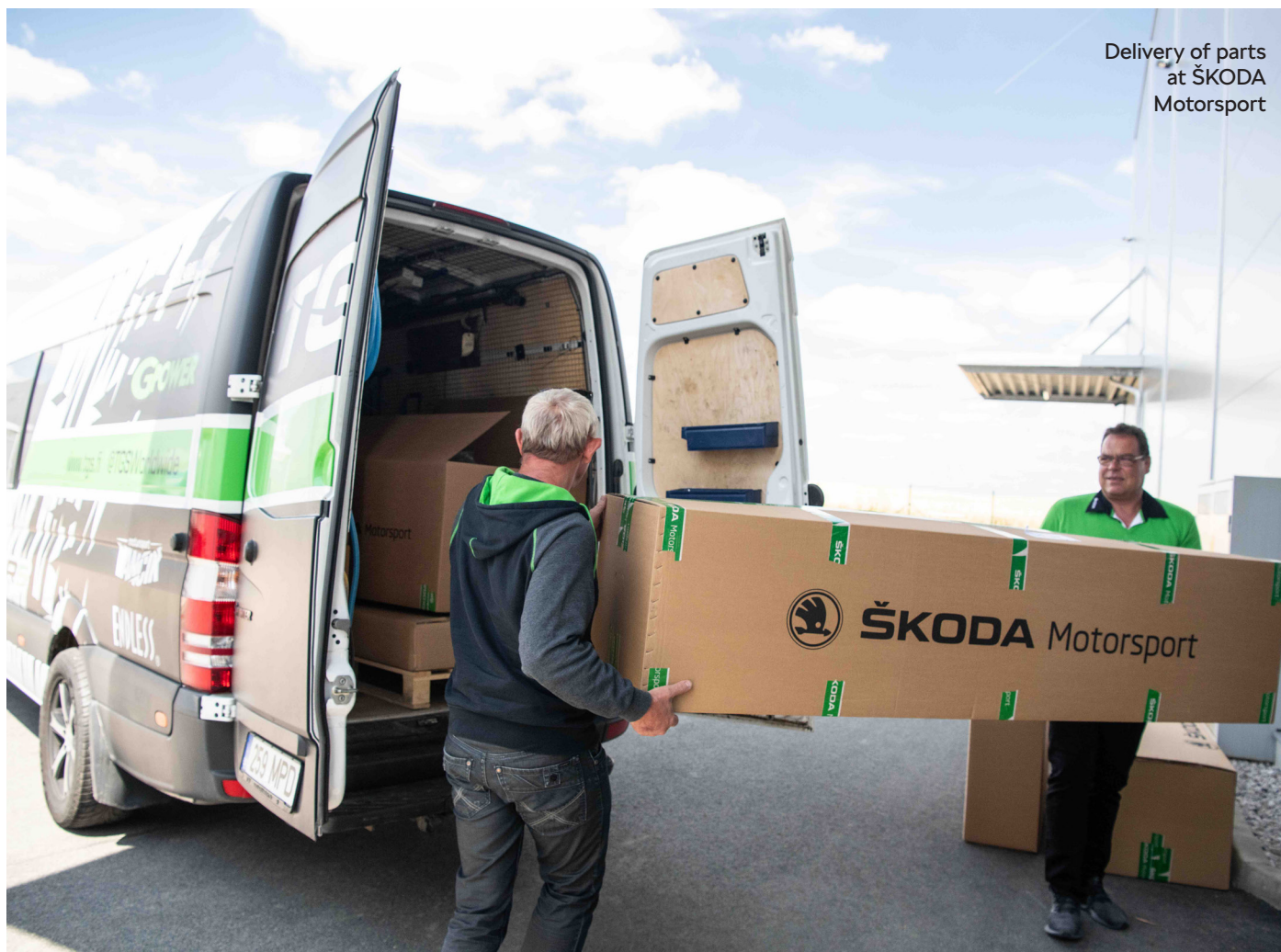
Delivery of parts at ŠKODA Motorsport