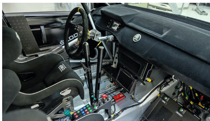
The interior of a ŠKODA FABIA Rally2 evo

Throughout the season, the after sales services of ŠKODA Motorsport repairs and revises around 54 engines, which corresponds with the capacity of the workshop next to the department responsible for the build of new engines. For customers, who want to repair and service their gearboxes themselves, ŠKODA Motorsport offers dedicated training. Since 2019, ŠKODA Motorsport provides as well rebuild and upgrade of dampers. So far, 33 customers used that service and sent in a total of 108 shock absorbers. This technical service is growing since the customers are getting more and more used to it.