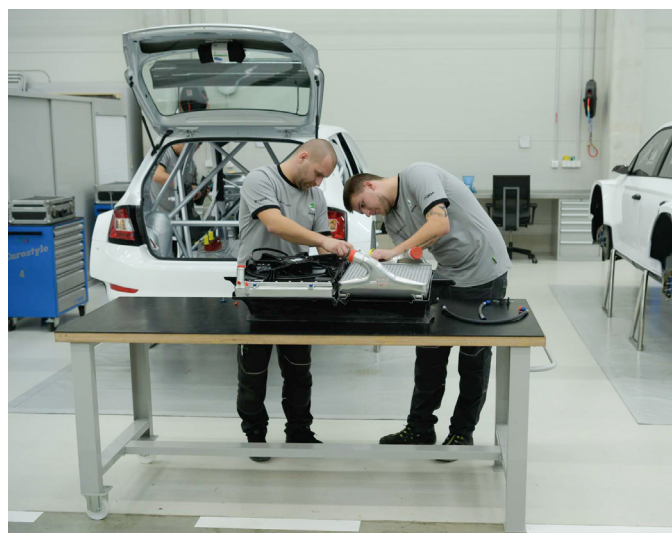
Inside the workshop of ŠKODA Motorsport

which offers different settings of friction faces and ramp angles. For specific track and surface characteristics and for maximum traction, a customer can also choose from two types of gearboxes with long or short gears. The engine electronics are adapted to the used fuel, usually stipulated by the regulation of the rallies the customer intends to enter. The mounting of the shift light, which helps the driver to select the right gear in order to make the best out of the engine power and range of revs, can be adjusted to the customer's needs.