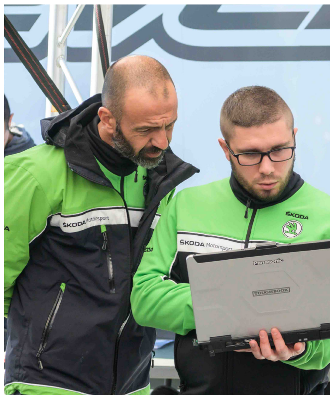
The engineers are always online

An engine engineer looks after the software and hardware of the engine before and during the event to insure trouble-free running for the whole rally. He recommends parts to be changed during the rally if it is necessary according to the technical status of the engine. The car technician looks