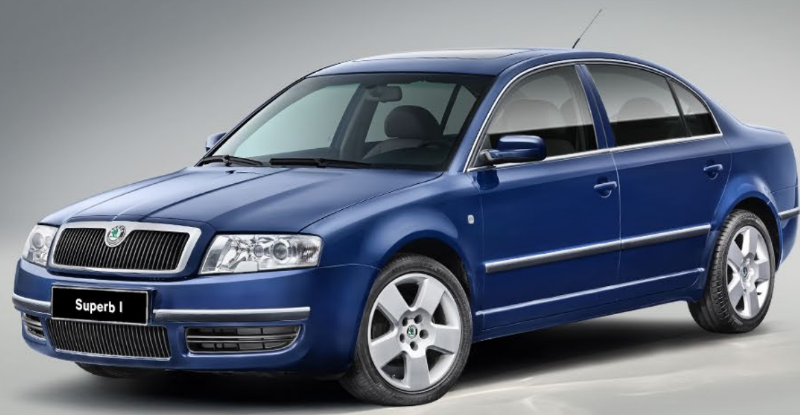
1 st generation

Sales, important markets and interesting facts