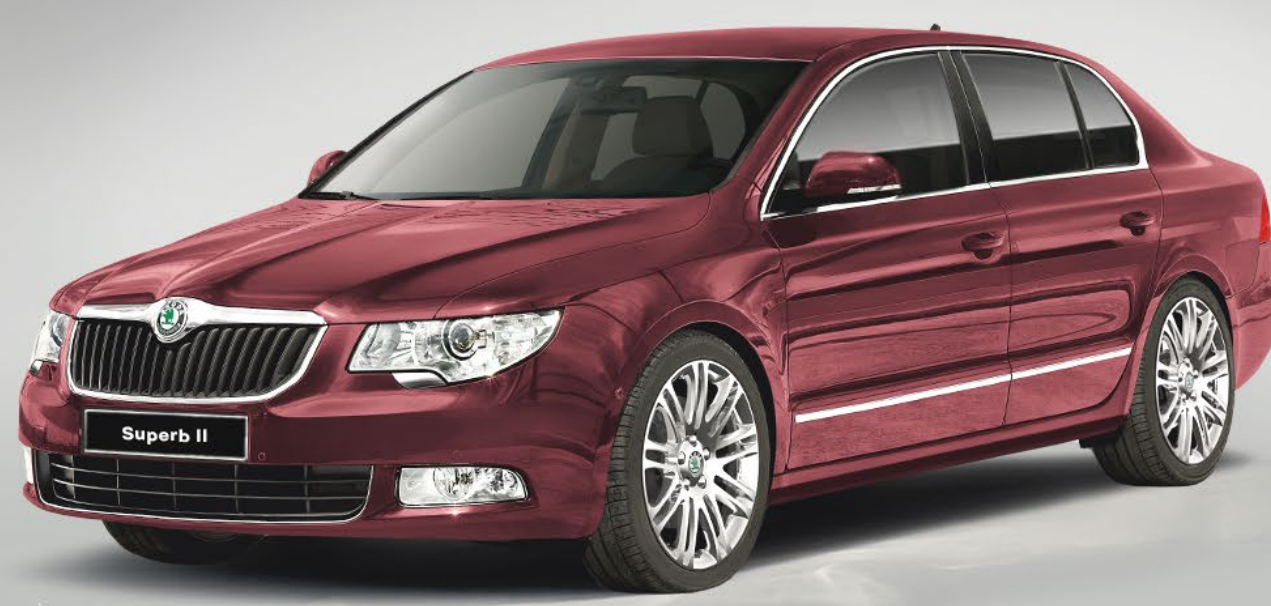
2 nd generation