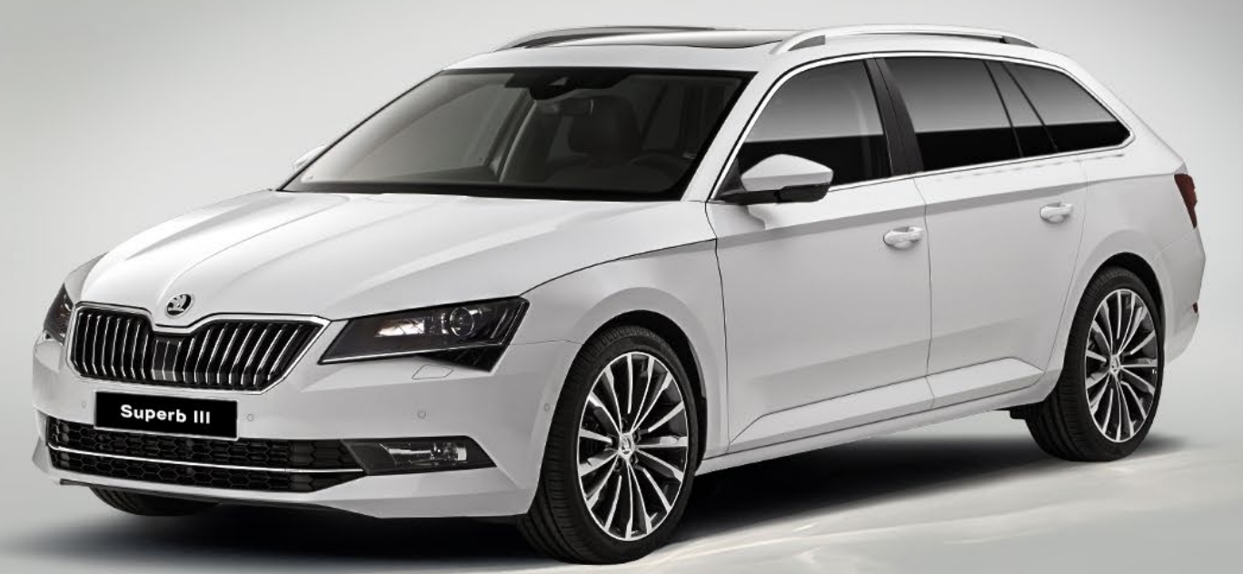
3 rd generation